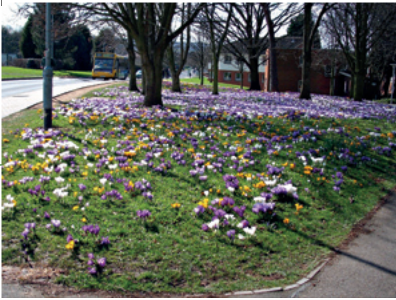
The crocuses on campus.