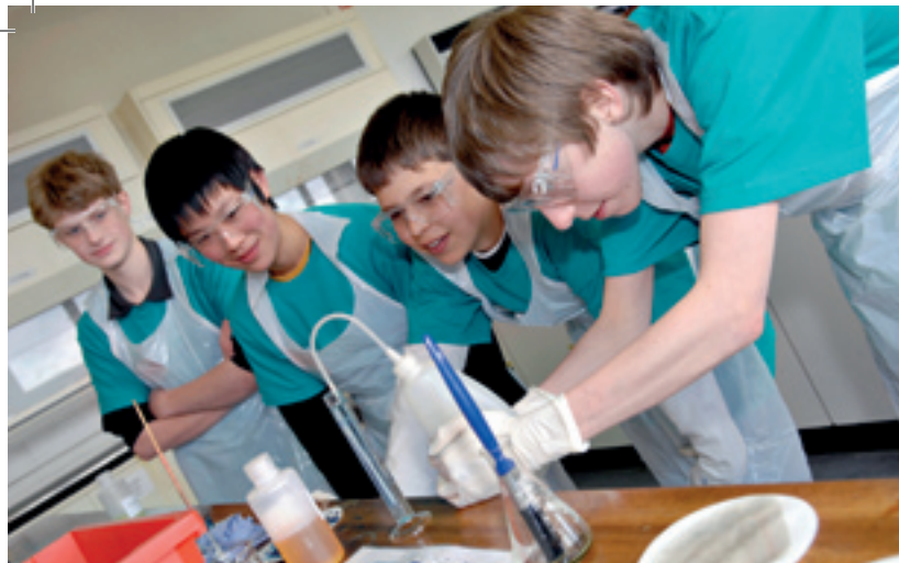
Students take part in the practical chemical problem solving exercise.