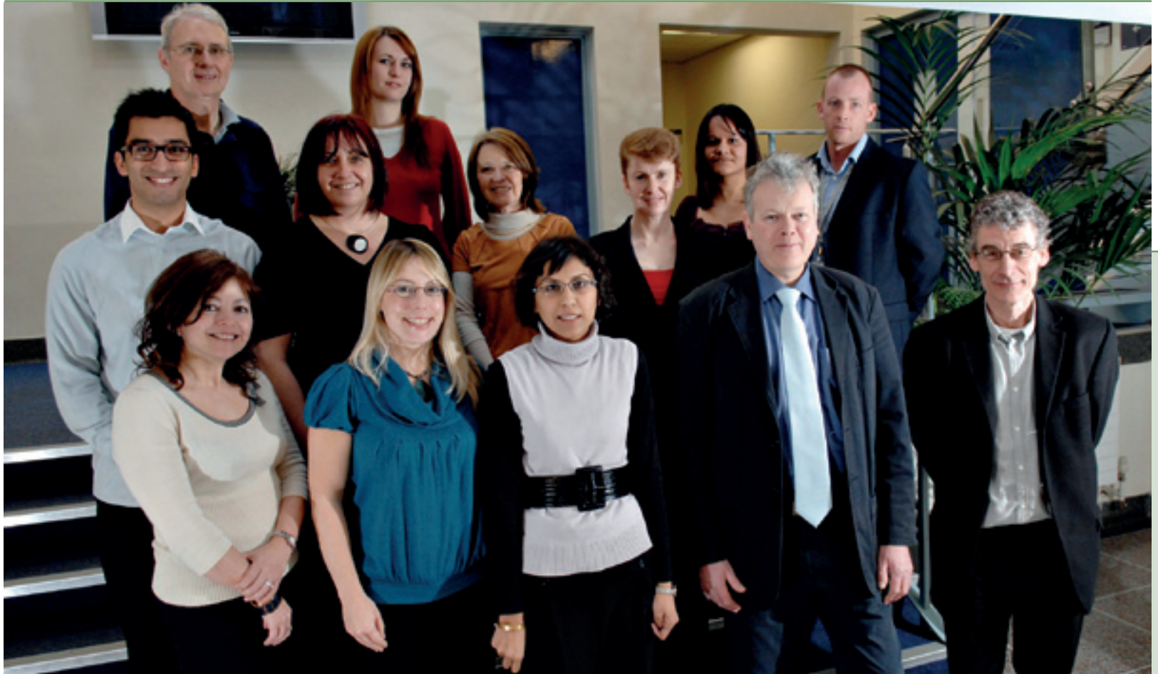
The Working Late research team.